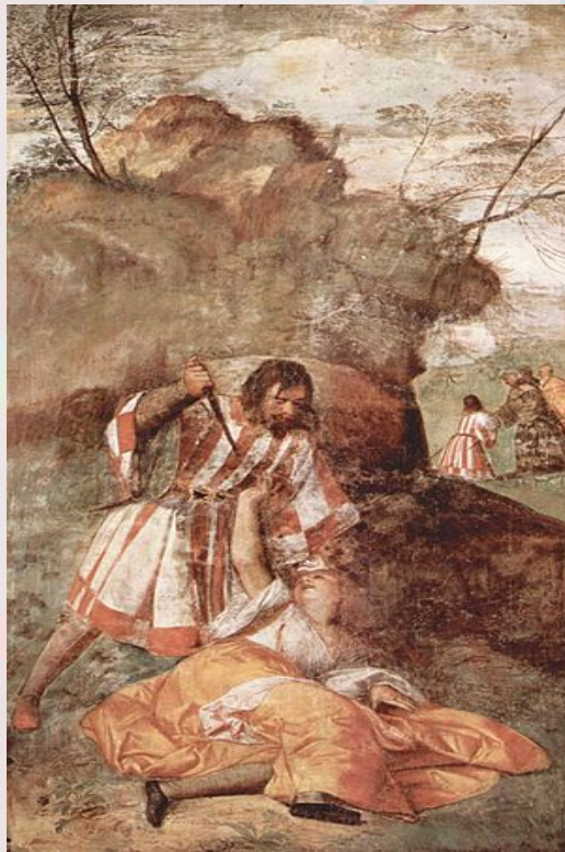
St. Mary Goretti (1890-1902)